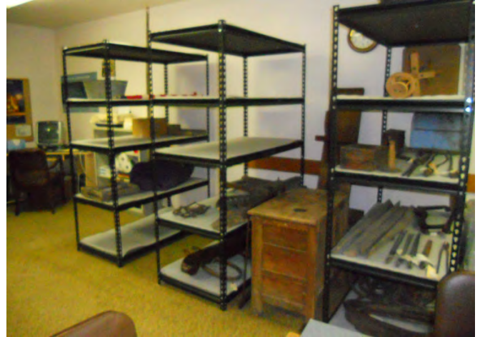
New artifact storage shelves have been installed at the Concord Museum.

The CHS received a matching mini-grant to purchase new shelves for large artifact storage. The Wisconsin Historical Society and Wisconsin Council for Local History provided the Concord Historical Society with the opportunity to improve our storage capabilities. This is the second matching Mini-Grant we have received to improve our artifact storage. We received the first grant in 2008 and purchased new metal cabinets for small artifact storage. The CHS is a member of the Wisconsin Council for Local History, which is an affiliate organization of the Wisconsin Historical Society. Many thanks to both of these organizations for their support of Concord's local historic preservation efforts.