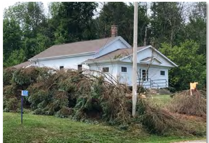
Tree destroyed in front of Concord Historical Museum